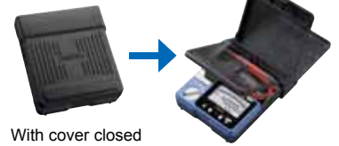
With cover closed